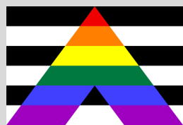
LGBTQ Ally Flag

Equal Sign: Equal Rights, Equality, Marriage Equality